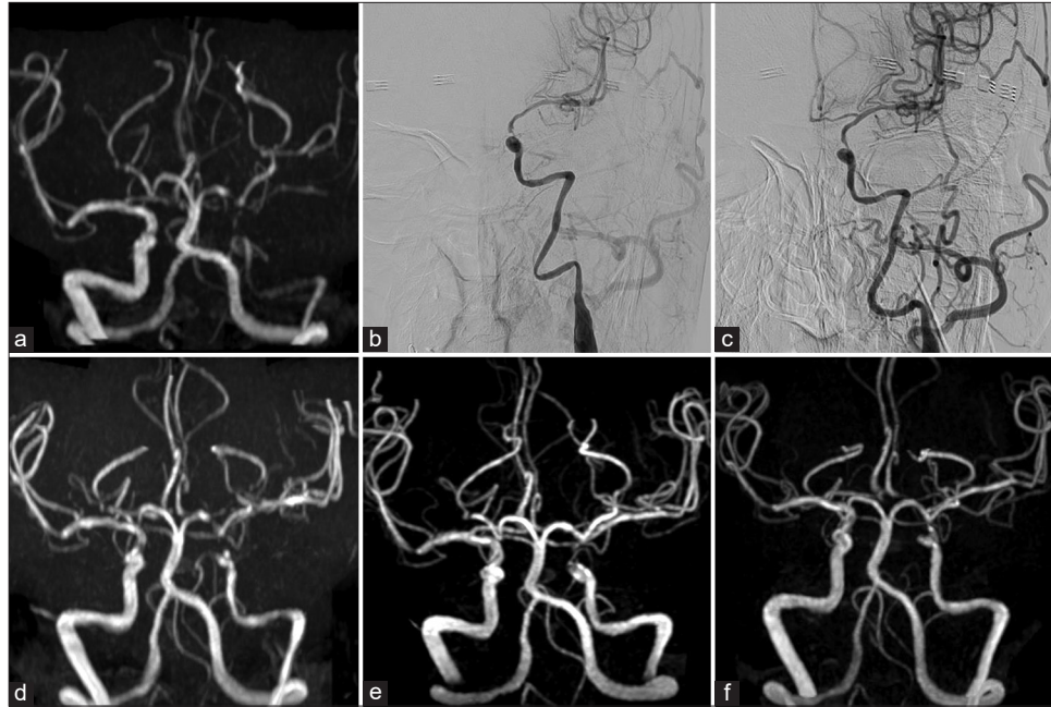
Figure 2: Perioperative images of initial percutaneous transluminal angioplasty. (a) Preoperative MRA showing reduced blood flow signals in the left ICA and left MCA. (b) Preoperative angiography showing severe stenosis of WASID 92% in the C3 portion of the left ICA with proximal ICA collapse and blood flow delay in the left MCA region. (c) Postoperative angiography showing dilatation of the stenosis (WASID 71%) and disappearance of blood flow delay in the left MCA region. (d) MRA the day after PTA showing increased blood flow signals in the left ICA and left MCA compared to preoperative ones, but the left-right asymmetry in ICA diameters remained. (e) MRA 5 days after PTA showing increased blood flow signals in the left ICA. (f) MRA 11 days after PTA showing maintenance of increased blood flow signals in the left ICA. MRA: Magnetic resonance angiography, ICA: Internal carotid artery, MCA: Middle cerebral artery, PTA: Percutaneous transluminal angioplasty, WASID: Warfarin-aspirin symptomatic intracranial disease.

performed for suspected progression of stenosis at the C3 portion of the left ICA. Although the left ICA maintained antegrade blood flow, severe stenosis of WASID 92% at the C3 portion of the ICA with proximal ICA collapse and blood flow delay in the left MCA region were observed [Figure 2b]. Since she was symptomatic with marked progression of stenosis, PTA was planned urgently and clopidogrel 300 mg was administered.