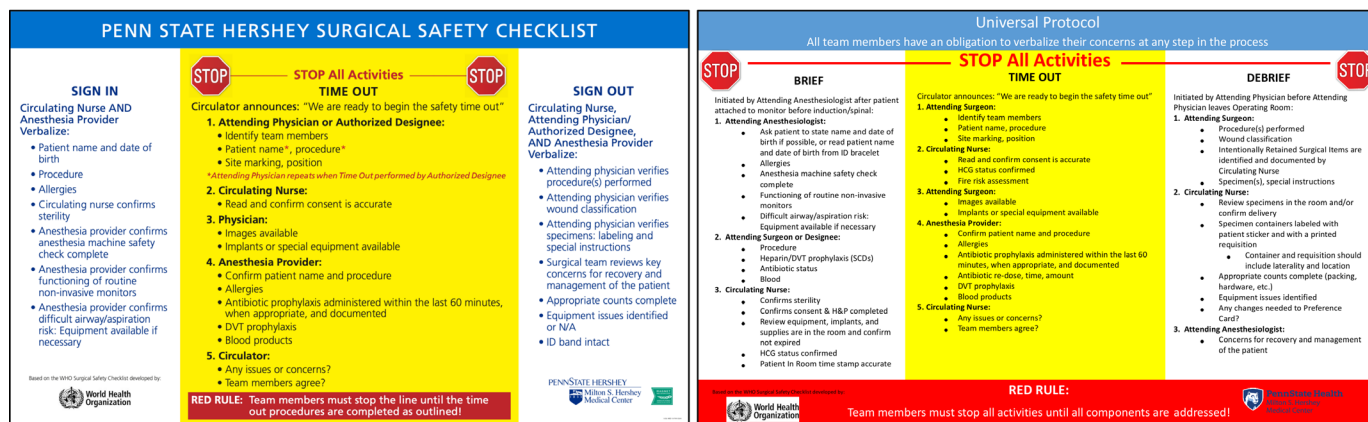
Figure 1 Preintervention and revamped surgical safety checklist posters depicting the inclusion of choice, dose and re-dosing intervals for antibiotics in the ‘time out’ process. SCD, sequential compression device; DVT, deep vein thrombosis; ID, identity; H&P, history and physical examination; HCG, human chorionic gonadotropin

targeting perioperative providers at our institution over 7 months from 1 January 2015 to 31 July 2015, with ongoing education every month in the form of email reminders. The following interventions were implemented: (1) Providing education to surgery providers (house staff, mid-level providers, faculty, operating room nursing staff) via classroom-based training sessions and email newsletters to increase awareness on appropriate choice, dosing and re-dosing intervals of antibiotics, (2) Providing similar education to anaesthesia providers (house staff, certified registered nurse anaesthetists, faculty), (3) Ensuring easy