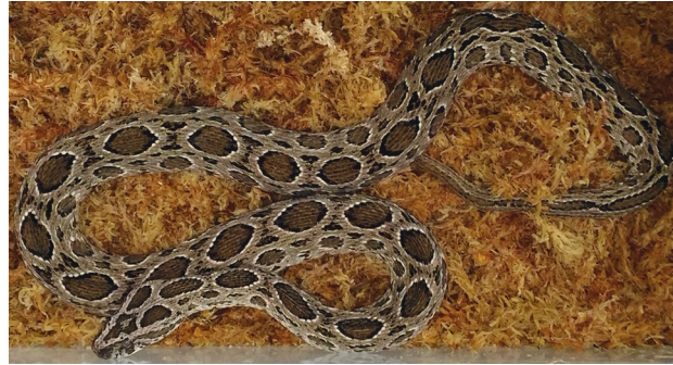
FIGURE 1: The culprit D. siamensis . A male D. siamensis originally captured from Kaohsiung City and housed in a reptile and amphibian facility; snout-vent length = 66.7 cm, tail length = 12.4 cm, bodyweight = 220 g.