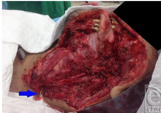
Figure 1. Ligated internal jugular vein.

(EJV) and internal jugular vein (IJV) are usually unavailable, thrombosed, or unsuitable for anastomosis. 3 In such cases, the surgeon is forced to look for other options. These include contralateral neck veins, use of a vein graft, or an alternate recipient vein. 4