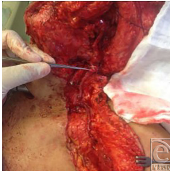
Figure 6. Cephalic vein rotated for anastomoses.