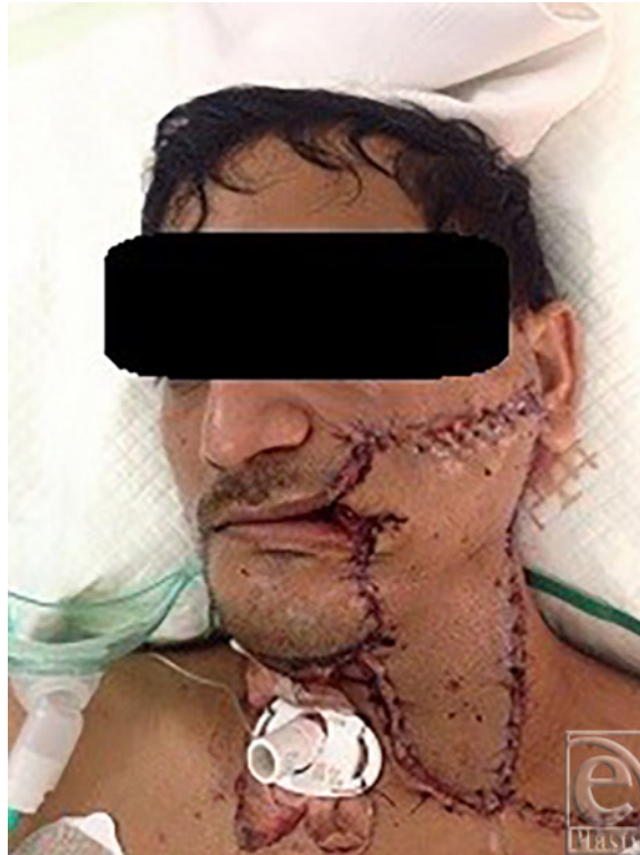
Figure 4. Postoperative day 4.