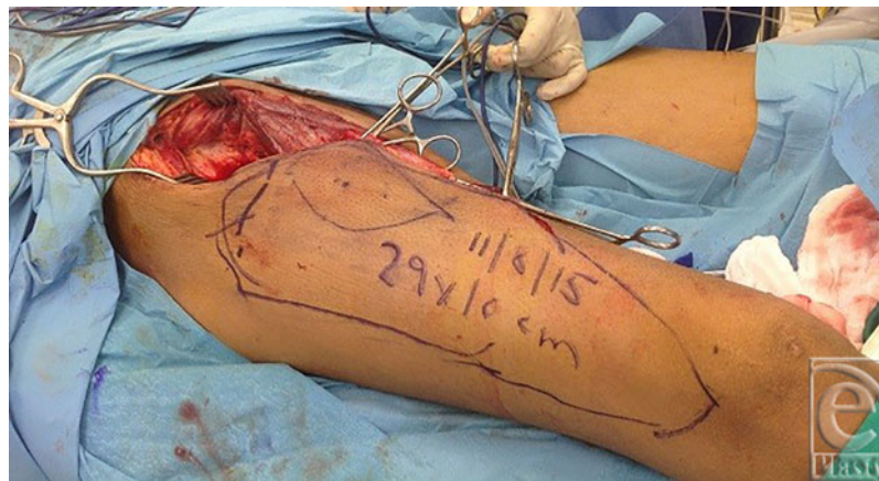
Figure 2. Harvesting of the anterolateral thigh flap.

A good option for alternate recipient vein is the cephalic vein. Use of the cephalic vein in microsurgery was first described by Hallock. 5 Horng and Chen 6 called it the lifeboat for head and neck reconstruction. The first series was published by Kim and Chandrasekhar. 7 Here, we report our experience with using the cephalic vein as a recipient vein in cases of head and neck cancer reconstruction.