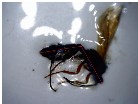
Figure 3. Example of prey item measurement.

"full", when at least one prey item was recognizable. For each full stomach content the minimum number of recognizable items was counted according to (ref. 5). For each typology of prey item, we counted the prey items as the sum of a ) whole prey, b ) heads, c ) residual of single abdomens and single heads (only when abdomens > heads). Considering that stomach contents often contained numerous prey segments, when single appendices were recognisable with confidence (e.g., pincers, elytra), and no head/abdomen were matching with them, we added to the previous count the half (rounded up) of the appendices sum. Using a digital microscope (MAOZUA 5MP 20×–300×) we took pictures of the intact prey items and measured the maximum length (mm) using a built-in software (Fig. 3).