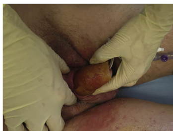
Fig. 2. The Manuka honey dressing before aquacel and regular gauze are added.