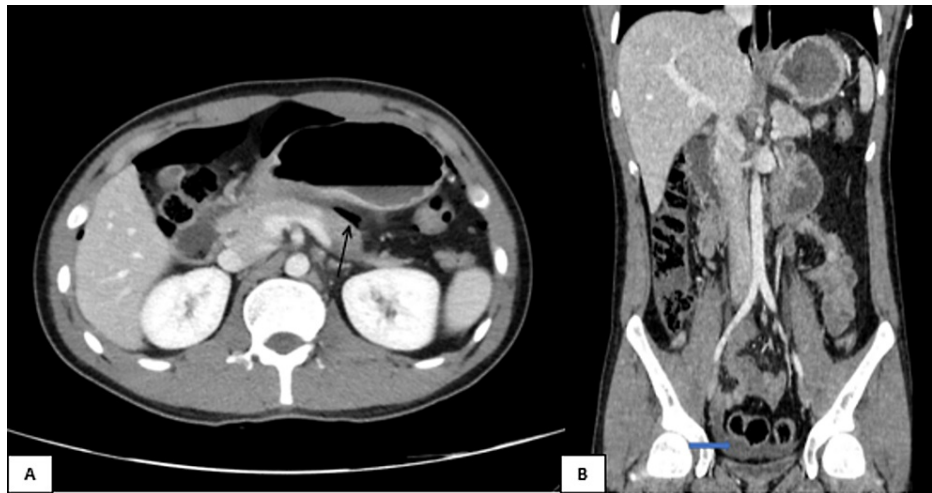
FIGURE 2: CT abdomen with IV contrast (A) axial and (B) coronal reformatted images showing pneumoperitoneum with free air in the lesser sac (black arrow) and free fluid in the pelvis (blue arrow).