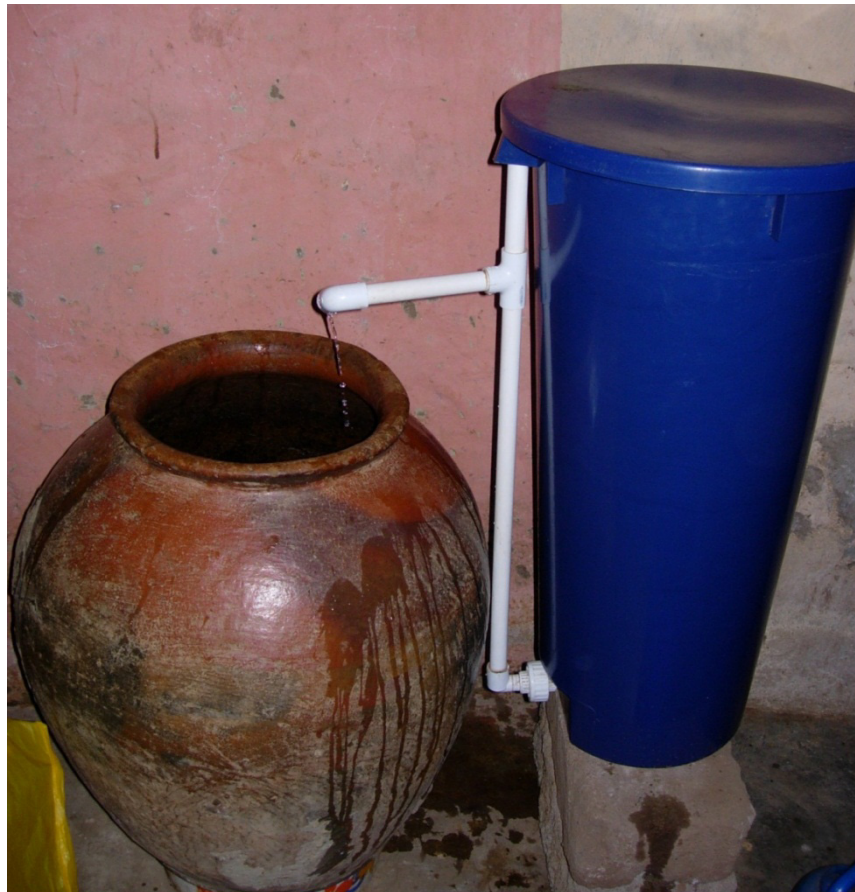
Figure 1. Typical set-up of the plastic BSF in a household in rural Tamale, Ghana (2008).

impoundments, [14]. The purpose of the RCT was to document the ability of the plastic BSF to improve water quality for both fecal indicator bacteria and turbidity and to reduce diarrheal disease in a setting where the population relies heavily on contaminated, highly turbid surface water for drinking and where the lack of access to water and sanitation are likely to be contributing significantly to morbidity and mortality in children under five years of age [2,14].