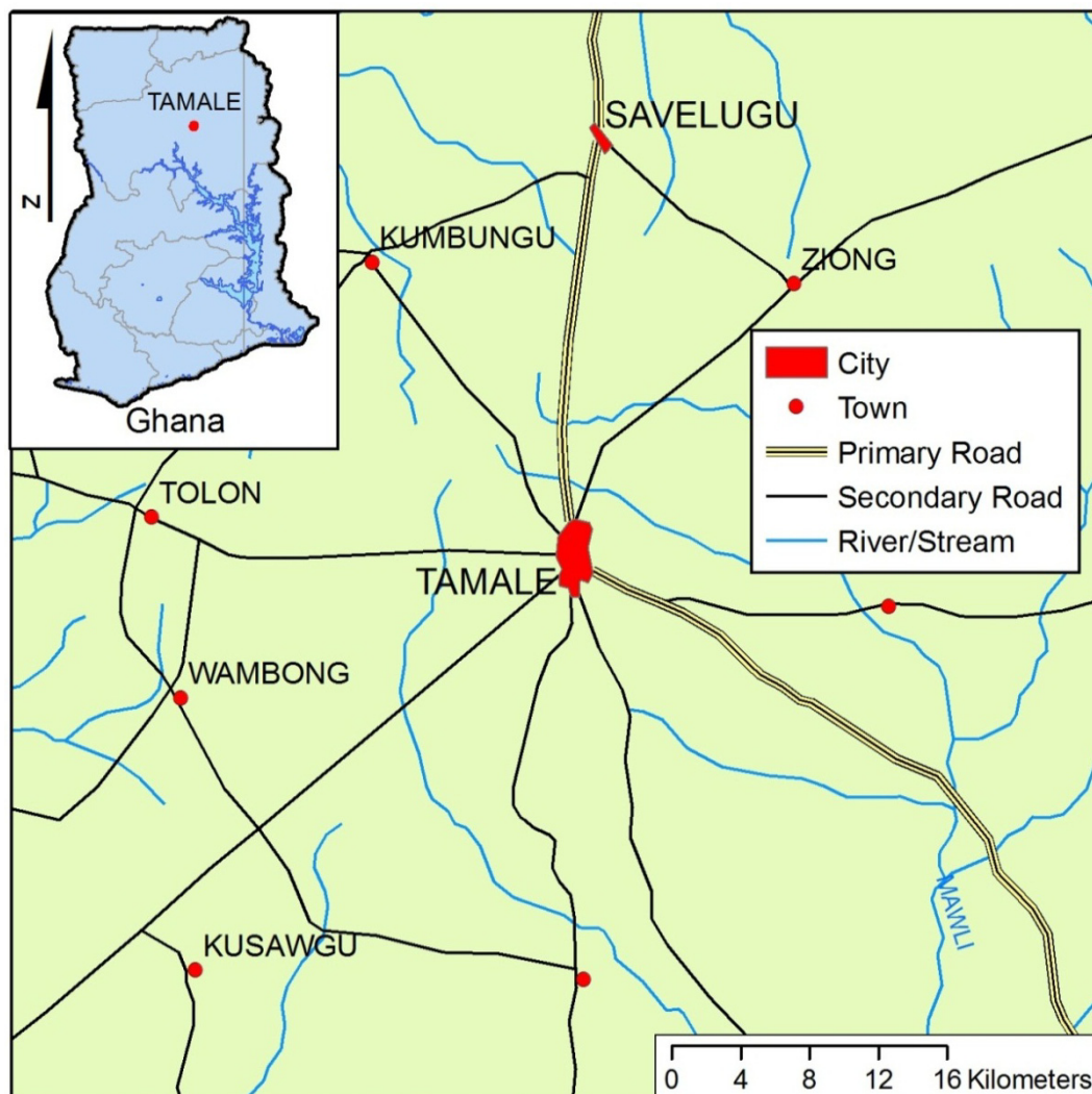
Figure 2. Map a (1:500,000) indicating the location for the Randomized Controlled Trial of the Plastic Biosand Filter in Tamale, Ghana (2008).

a The map was based on VMAP0 2000 data [15] and was formatted using ArcGIS 10 (ESRI, Redlands, CA, USA).