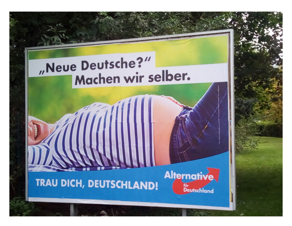
FIGURE 1 'New Germans? We'll make them ourselves, trust yourself Germany' (Valodnieks, 2017) [Colour figure can be viewed at wileyonlinelibrary.com]