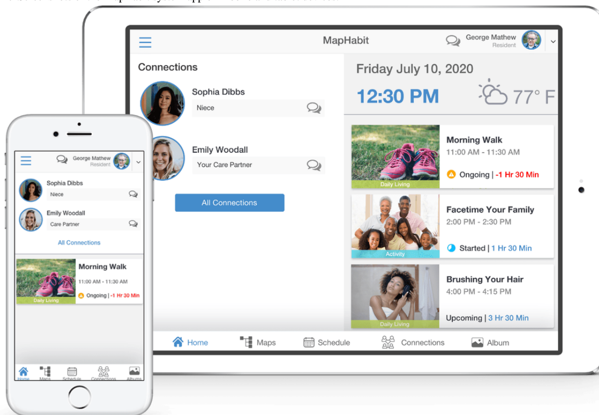
Figure 1. Screenshots of the MapHabit system app on mobile and tablet devices.