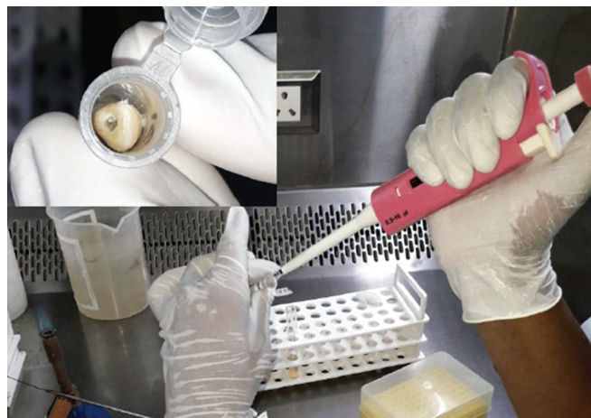
Fig. 3: Inoculation of E. faecalis into the root canal

All the 15 samples under the 2 mm biodentine apical plug group turned turbid whereas only 11 out of 15 under the 2 mm MTA apical plug group turned turbid over 3 months. No statistically significant difference ( p > 0.05 ) was found among 2 mm MTA and biodentine apical plugs. The number of samples that showed leakage over 3 months in the 4 mm MTA and biodentine apical plug group also were statistically insignificant ( p > 0.05 ) (Table 4). The comparative evaluation of the total number of samples that