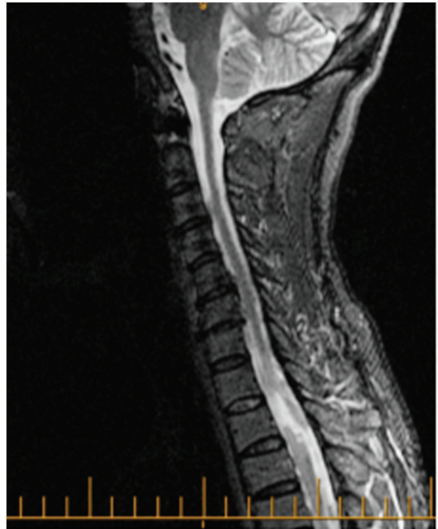
Figure 4. 50-year-old female with hematoma from T1 to T5 measuring 0.65-cm thick and 8.9 cm in length. Improved from ASIA A to ASIA B with surgery.

A 50-year-old female was admitted for the treatment of fever and leukopenia. During her stay, she developed a complete motor deficit from T4 down. Her laboratory blood analyses revealed a low white cell count but were otherwise normal. An MRI done 3 days after the onset of her symptoms showed a four-level epidural hematoma extending from T1 to T5, causing the spinal cord compression seen in Figure 4. The hematoma was 0.65 cm in thickness and 8.9 cm in length. The patient underwent urgent decompressive laminectomy to evacuate the hematoma. Her ASIA score was A pre-operatively and did not change immediately post-operatively. However, a follow-up visit at 3 months showed improvement to an ASIA score of B.