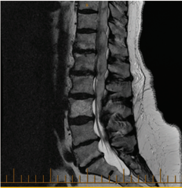
Figure 3. 76-year-old female with hematoma from T7 to L1 measuring 1.2-cm thick and 15 cm in length. Improved from ASIA D to E with surgery.

other limbs were 5/5. Laboratory blood analyses were normal with an INR of 1.04. Urgent MRI showed a large ten-level epidural hematoma starting from T7 to L4, with a thickness of 1.2 cm and a length of 15 cm, causing the spinal cord compression seen in Figure 3. Laminectomy and hematoma evacuations were performed 28 h after the onset of her symptoms. The patient's ASIA score was D pre-intervention and it did not change immediately following surgery. However, she fully recovered to an ASIA score of E at both her 6 and 12 week follow-ups.