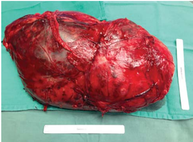
Figure 2 Gross specimen of left adrenal myelolipoma measuring 34×20×13 cm.

However, due to concern for malignancy, such as liposarcoma, and symptoms from mass effect, the patient underwent bilateral resection of the retroperitoneal masses. Intraoperatively, adrenal glands were not visualized. Pathologic examination revealed fat interspersed with myeloid tissue and a diagnosis of bilateral myelolipomas was made. The left tumor was 34×20×13 cm and weighed 4.7 kg (Fig. 2). The right tumor measured 20 cm in maximal dimension and was removed in three separate fragments. Adrenal tissue was present in the both tumors (Fig. 3).