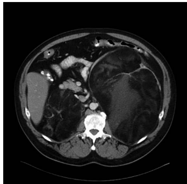
Figure 1 CT scan of abdomen showing giant bilateral myelolipomas.

The differential diagnosis of these masses included benign lesions such as lipoma, teratoma, or myelolipoma.