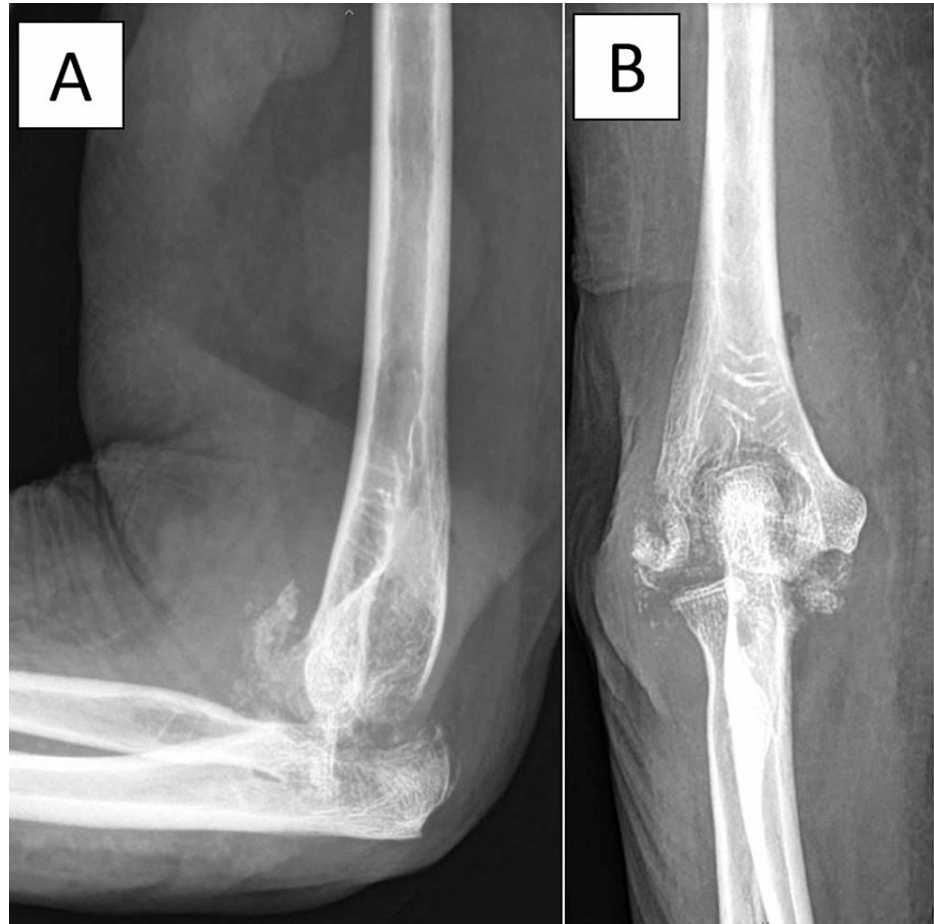
FIGURE 1: Plain film of the patient's left elbow showing osteolytic lesions around the elbow joint and severe bone destruction with dislocation of the elbow joint.

A magnetic resonance imaging (MRI) showed abnormal bone marrow edema involving the distal humerus, proximal radius and ulna with a moderate amount of joint fluid with diffusely enhanced thickened synovium. There was severe destruction of the elbow joint (Figures 2A-2C), which we diagnosed as septic arthritis and osteomyelitis of the elbow.