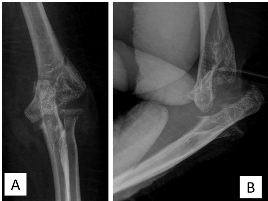
FIGURE 4: The radiograph shows pseudarthrosis of the elbow.