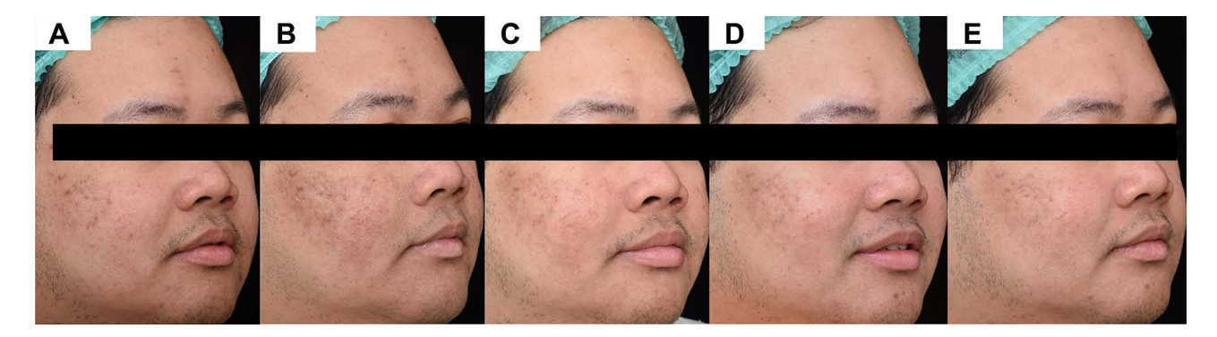
Figure 2 Postoperatively treated side with the sunscreen A. (A) Baseline, (B) I-week I, (C) 2-week, (D) 4-week, and (E) 6-week follow-up visit.