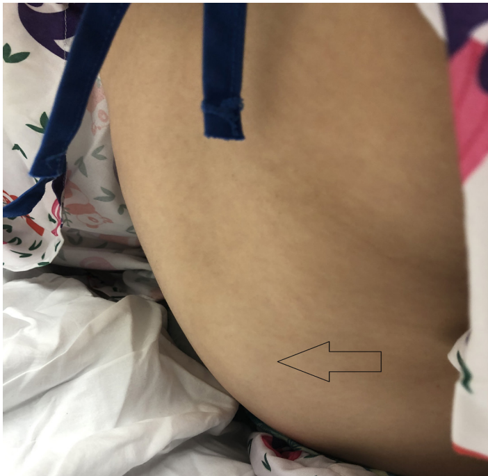
Image 1. Photograph of the patient's lower back demonstrating lumbar soft tissue swelling indicated by the arrow.

breaths per minute, and 99% pulse oximetry on room air. She was refusing to ambulate secondary to pain but was otherwise nontoxic appearing. There was an oval area of cutaneous edema, similar in shape to an American football, approximately 10 centimeters (cm) vertically and 8 cm transversely, stretching from her lower thoracic spine down to her lower lumbar spine over which she had moderate tenderness (Image 1). She had mild, non-pitting pedal edema and was noted to have a palpable purpuric rash over her ankles and lower legs. Abdominal and neurologic examinations were benign, and the remainder of the physical exam was unremarkable.