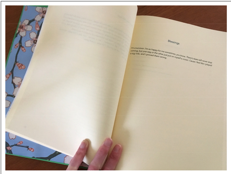
Figure 1. Handmade book of interview transcript.

Sometimes you just have to kick the Nigerians away.