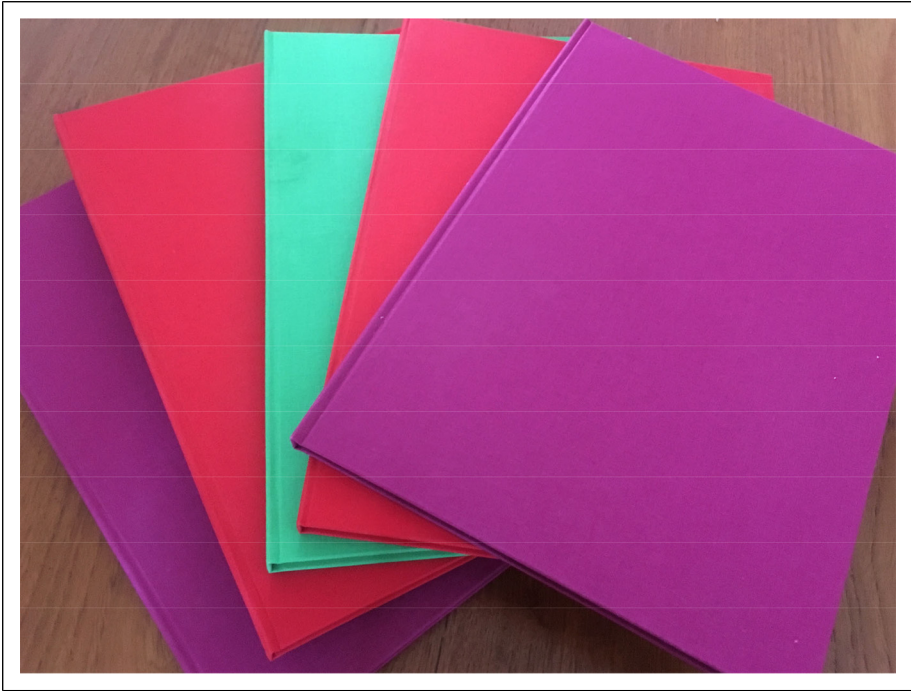
Figure 2. Handmade books.