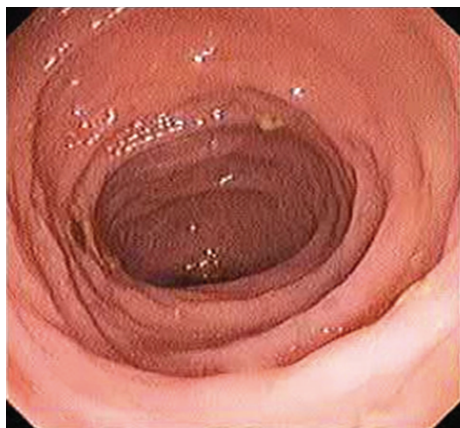
FIGURE 3: Endoscopic view after two years of treatment showing a normal intestinal mucosa.

There is a bimodal age incidence, with one peak for children below 13 years and second peak for middle-aged adults [5]. The mean age at diagnosis was around the fifth decade of age [2]. Malacoplakia is rare in children and usually involves the gastrointestinal tract, and is associated with significant additional systemic disease [8]. A female-to-male preponderance of 4:1 is reported when the disease affects genitourinary system [2, 7]. In the other locations, male and female patients were equally affected [7].