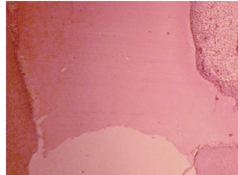
Figure2. Dentinal bridge formation 2 months after pulpotomy with sodium hypochlorite (H and E×40)