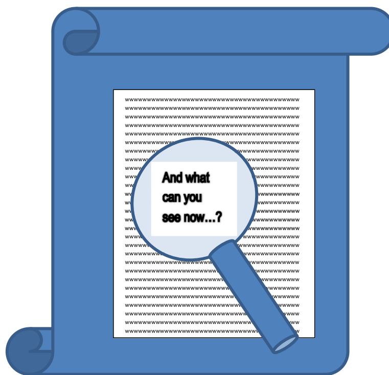
Fig. 1 “Precision” itself does not guarantee for better understanding of an issue. An old wise dictum adopted by all European cultures/languages warns— one cannot see the forest for the trees . Hence, technologically driven higher resolution of individual elements does not automatically mean that you can better recognise the complex problem which you are looking for, particularly when the zoomed element (the tree) is prioritised and/or pulled out from the overall context or zooming itself makes the complete picture (the forest/multifactorial issue) unreadable. Contextually, better understanding of the complexity in medicine is not guaranteed by “precision medicine” itself. Advanced health care demands a close cooperation between all issue-related fields, integration of multidisciplinary knowledge and innovative technologies based on long-term strategies and concepts considering interests of patients, professionals and society at large

Global deficits are well-defined and described elsewhere as unpredictable, unpreventable and impersonal medicine [20, 21]. It is evident that a paradigm shift is needed to move from “reactive” to “predictive, preventive and personalised medicine” as a new philosophy