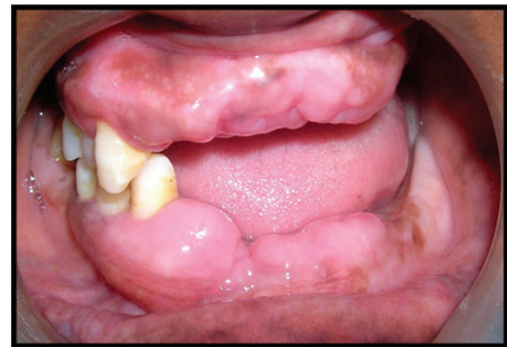
FIGURE 8: Postoperative view of female patient. It was shown that the left side gingival enlargement was cured.