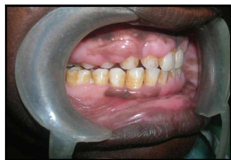
FIGURE 9: Postoperative view of male patient after six months.