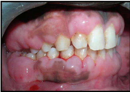
FIGURE 4: Pocket marker marked the bleeding points that denoted the excess portions of gum of male patient.