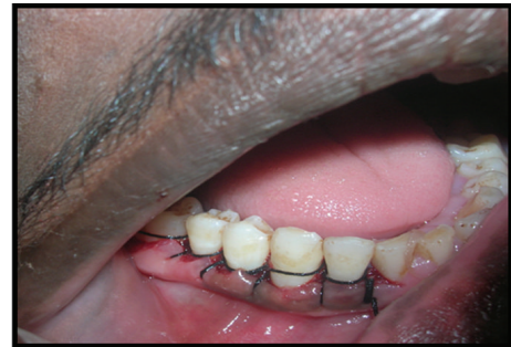
FIGURE 7: Gingivoplasty was done and continuous sling sutures were placed.