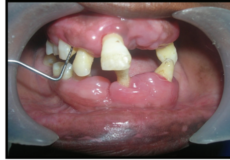
FIGURE 1: Female patient with gingival enlargement (preoperative view).

2.3. Clinical Diagnosis. This enlargement affects the attached gingiva, as well as the gingival margin and interdental papilla, in contrast to phenytoin induced enlargement, which is often limited to the gingival margin and interdental papillae. The facial and lingual surfaces of the mandible and maxilla are generally affected, but the involvement may be limited to either jaw. The enlarged gingiva is pink, firm, and almost leathery in consistency and has a characteristic minutely pebbled surface. In severe cases teeth are almost completely covered, and the enlargement projects into the oral vestibule. The jaws appear distorted because of the bulbous enlargement of the gingiva. Secondary inflammatory changes are common at the marginal gingiva.