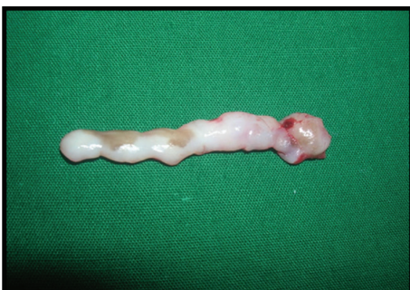
FIGURE 6: Surgically removed excess tissue.