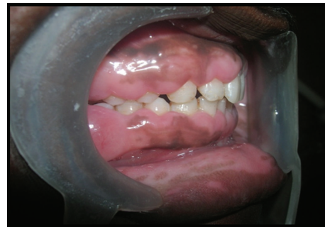
FIGURE 2: Male patient with gingival enlargement in milder form (preoperative view).