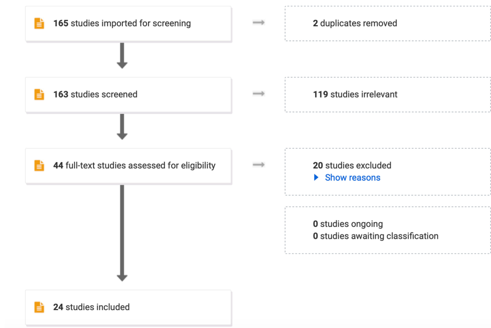
Figure 1 LASER search.