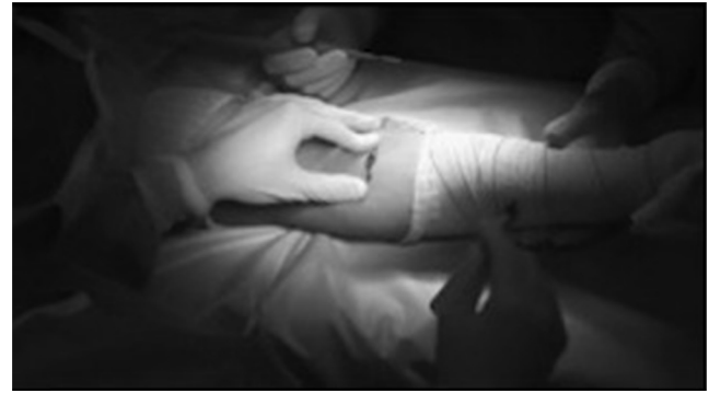
Fig. 2 – Single access route.

A single access route was created approximately 2.5 cm from the cubital flexion crease, guided by fluoroscopy for initial location of the radial tuberosity on its ulnar edge (Fig. 1). A 5-cm surgical incision in the anterior region of the proximal third of the forearm, at the radial tuberosity, in the transverse plane, with careful dissection of soft tissues, allowed the search in the superficial plane for the distal biceps tendon stump, proximally retracted (Fig. 2). Traction sutures were passed through the biceps tendon in its tendinous portion to enable its mobilization and re-approximation at its anatomical insertion, at the ulnar edge of the radius, with the forearm in complete supination and at 10° of elbow flexion (Fig. 3). The