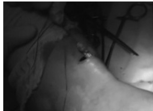
Fig. 3 – Traction suture in the ruptured distal biceps tendon.

soft tissue and the lacertus fibrosus were released to allow increased mobility when necessary. The radial tuberosity was exposed by delicately displacing soft tissues, thus avoiding neurological and vascular injury. Then, the radial tuberosity was debrided for removal of residual tendon tissue and scarring, in order to allow bleeding, aiming to potentiate adhesion of the reinsertion.