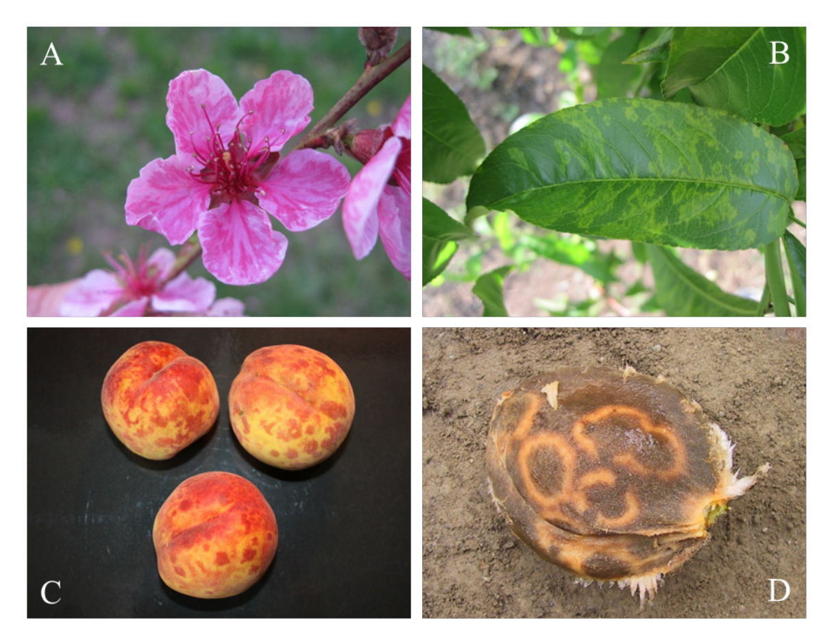
Figure 1. (A) Peach blossoms showing typical speckling of Plum Pox infected trees. Note the darker pink stripes on petals. (B) Chlorotic rings and blotches develop in peach leaves. (C) Yellow rings on a yellow-fleshed peach cultivar. (D) Ring patterns visible on the pit of an apricot.