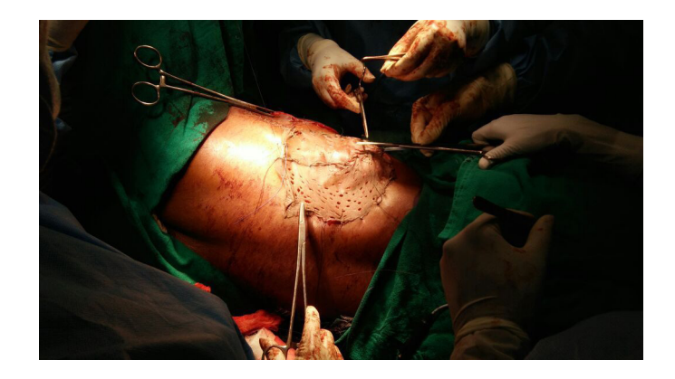
Figure 4. Donor site covered with split skin graft from right thigh.