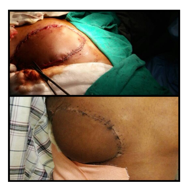
Figure 3. Reconstruction with myocutaneous LD flap after WLE of the tumour. Intra-operative view (top). Post-operative view (bottom).

An elliptical incision was made around the tumour, taking 2.5-cm margin including the previous surgical scar and right nipple-areola complex due to its proximity. The tumour was excised, taking a 2.5-cm circumferential margin, including the surrounding breast tissue and extending up to the pectoralis major fascia. On assessing the tumour grossly, it was felt that it was reaching up to deep margin. Therefore, an intra-operative decision was taken to do a cavitary shave of the deep margin including 1 cm of pectoralis major muscle. The LD flap was raised and placed over the defect (Figures 2 and 3). The donor site was covered with a skin graft from the right thigh (Figure 4).