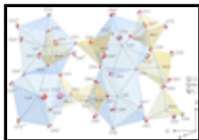
Fig. 1. Fragment of the crystal structure of \text{La}_4\text{Mo}_7\text{O}_{27} . Atoms are indicated as ellipsoids with probability regions of 50%. [Symmetry codes: (i) -x+1, -y, z+1/2 ; (ii) -x+1, -y-1, z+1/2 ; (iii) -x+3/2, y, z+1/2 ; (iv) x, y+1, z ; (v) x, y-1, z ; (vi) x-1/2, -y-1, z ; (vii) x-1/2, -y, z ; (viii) -x+3/2, y-1, z+1/2 ; (ix) x+1/2, -y, z ; (x) x+1/2, -y-1, z .]