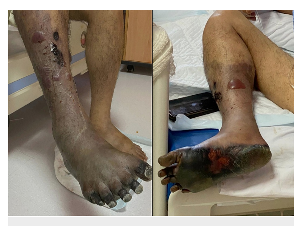
FIGURE 3: Right lower limb gangrene

Right lower limb showing a black discoloration of the sole and dorsum of the foot with all toes (dry gangrene) associated with multiple swelling, bullae, and discharge in the leg with the demarcated line below the knee (wet gangrene)