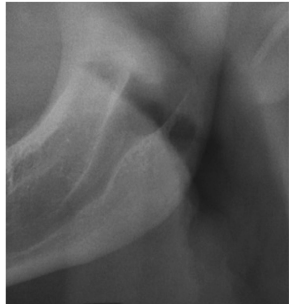
Fig. 3 Enlargement of mandibular canal and mandibular foramen on the left side in 29 years old male patient with DS

Sakellari et al. [6] showed that periodontal inflammation was more common in DS individuals than in cerebral palsy patients and in healthy subjects under 30 years of age [5]. In addition, Amano et al. [24] found that the level of Porphyromonas gingivalis in people with DS over 5 years of age was higher than in non-DS individuals. Corcuera-Flores et al. [13] used panoramic radiographs in their study and showed that DS individuals have a higher risk of marginal bone loss around the implants. The C-AUL score was lower in DS individuals than in non-DS individuals, regardless of gender. This result is consistent with the literature with regard to demonstrating marginal bone loss. Because panoramic radiographs were used in this study, only the height of the alveolar bone was measured. There are no data on clinical periodontal measurements or periodontal soft tissues. Therefore, based on the findings of this study, the low C-AUL score in DS individuals compared to non-DS individuals cannot be explained by only marginal bone loss related to periodontal disease. Growth and development retardation in DS individuals or changes/errors in reference measurement points may also be among the reasons for low bone height.