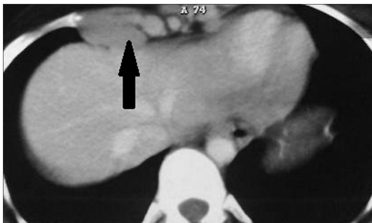
Figure 1. A 23-year-old man with Hodgkin's lymphoma presented with enlarged lymph node (black arrow) in internal mammary zone. This pattern is found to be highly in favor of Hodgkin's lymphoma rather than sarcoidosis.