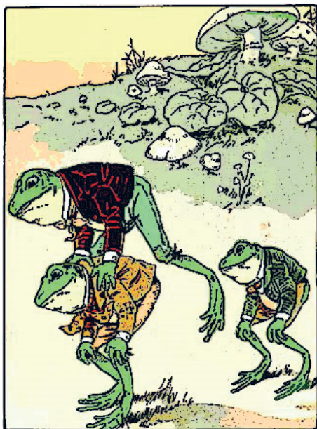
Photo: LMICs leapfrogging with collaborative support and lessons learned from HICs to tackle dementia.

the dementia burden. These findings may be extended to LMIC and this article discusses these opportunities and how they can be applied.