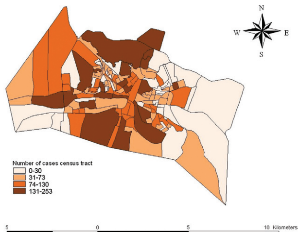
Fig. 3: spatial distribution of notified cases of dengue per census tract, Jequié, state of Bahia, Brazil, 2008 [from epidemiological week 47 (source: SESAB/DIVEP 2012)]-2009.