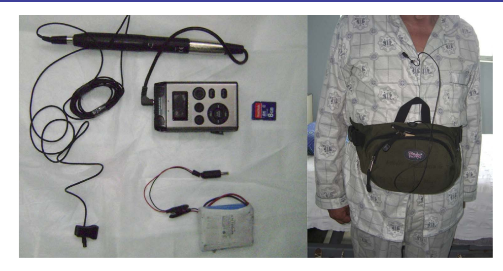
Figure 2 Picture of the Cayetano Cough Monitor (CayeCoM).

algorithm. On the basis of classifier outputs, each acoustic event will be marked as 'cough' or 'not-cough'.