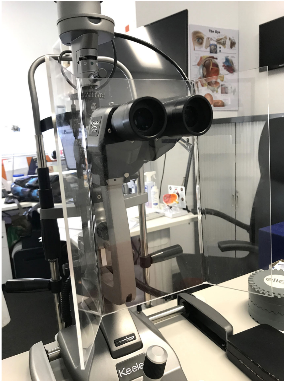
Figure 2. Slitlamp protective breath shield