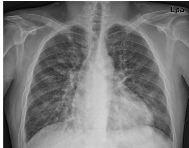
Fig. 1. Chest radiograph showing infiltration in both lower lobes and cardiomegaly.

A renal biopsy and bronchoscopy were promptly performed. Bronchoscopic examination showed mild hyperemia in both bronchi, with red bronchial alveolar lavage fluid. Light microscopic examination of the renal biopsy showed proliferative endarteritis in interlobular arteries and fibrinoid necrosis and intramural thrombi of small arterioles without crescent formation or necrotizing lesions, consistent with hypertensive nephrosclerosis (Fig. 3). Steroid therapy was rapidly decreased and stopped. A trans-bronchial lung biopsy showed macrophage infiltration into alveolar spaces and goblet cell metaplasia in bronchial mucosa generally seen in heavy smokers. Vanillyl-mandelic acid, metanephrine, epinephrine, and norepinephrine in 24-h urine samples were within normal levels. Tests for anti-glomerular basement membrane antibody and anti-neutrophil