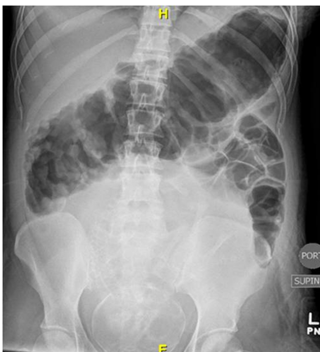
Fig. 1. Preoperative plain film abdominal radiograph of a 26 year old lady with suspected toxic colitis. The single frontal supine view demonstrates a diffusely distended transverse colon with displacement by the gravid uterus.

delivered with apgar (appearance, pulse, grimace, activity, respiration) scores of 9 at one minute and 9 at five minutes; weight 1.474 kg and height 36.2 cm. Immediately after delivery, the mid-line incision was extended approximately 2 cm cephalad and a total abdominal colectomy with end ileostomy was performed. Total operative time for the combined procedures was 96 min and estimated blood loss was 250 ml. The patient was discharged nine days postoperatively in stable condition; while the neonate was stabilised in the intensive care unit, where, ventilator support was initially required. He was weaned off of the ventilator, transitioned to a neonatal progressive care unit and eventually discharged home two weeks after birth. Pathologic examination of the surgical specimen confirmed the diagnosis of toxic megacolon with transmural inflammation and erosion of the bowel wall in regions (Fig. 2). Four weeks post-operatively, the patient underwent completion proctectomy and creation of an ileal reservoir with construction of an ileoanal anastomosis and diverting ileostomy. The reason for accelerating the procedure was based on patient choice and the fact that she had recovered very well from her emergency colectomy. Operative time was 177 min and estimated blood loss was 200 ml. The loop ileostomy was reversed three months later (Fig. 3).