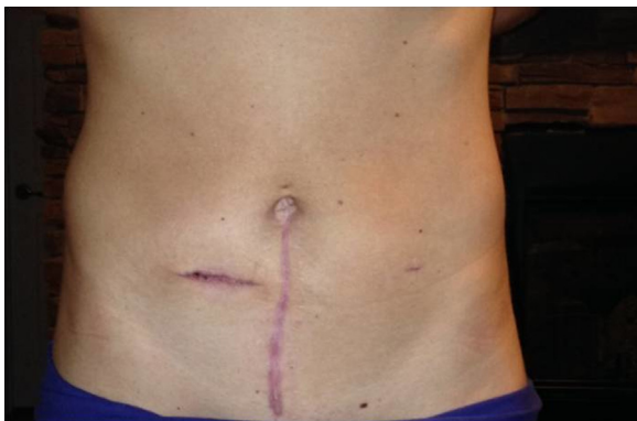
Fig. 3. Infraumbilical laparotomy and closure of ileostomy scars two months after ileostomy reversal.

particularly when toxic megacolon occurs in the second trimester (Table 1) but morbidity and mortality rates are still noticeably high for both [14].