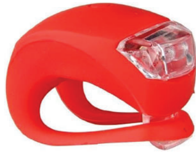
Fig. 1. An example of a red silicone LED bicycle light (available from many different manufacturers).

Sets of three photographs were taken of hands and feet (i) with no transillumination (control), (ii) with transillumination with a cold light, and (iii) with a red silicone LED bicycle light (Figs 1 and 2). Photos were taken in the Neonatal Intensive Care and Special Care Baby Unit in the normal clinical environment. Babies remained in their incubators, the background lighting being dimmed to the