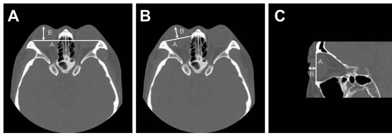
Figure 1 Three CT techniques for proptosis estimation. (A) Method 1: A line is drawn between the lateral orbital rims on the section that bisects the lens. B line is drawn between A line and the posterior surface of the cornea. (B) Method 2: A line is drawn between the lateral and medial orbital rims on the same axial plane. B line is drawn between A line and the posterior surface of the cornea. (C) Method 3: A line is drawn between the superior and inferior orbital rims on the sagittal plane. B line is drawn between A line and the posterior surface of the cornea.

measuring proptosis differences between eyes. A proptosis difference larger than 2 mm was the classification criteria.