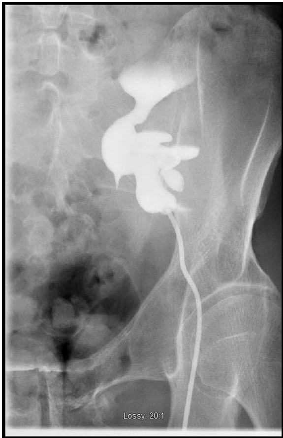
Figure 1. Preoperative antegrade nephrostogram showing complete occlusion of ureter.

was identified and found to have a significant fibrotic rind. Ureterolysis was performed until we had circumferential control of several centimeters of the transplant ureter from just distal to the iliac vessels to the renal pelvis. The ureter itself was partially transected, but no identifiable mucosal lumen was identified. The transplant kidney renal pelvis was found to be predominantly intrarenal. The renal hilum was encased in severe fibrosis, precluding further dissection without placing the vasculature at risk. Given these findings of an inaccessible renal pelvis, consideration was given to vesicocalicostomy.