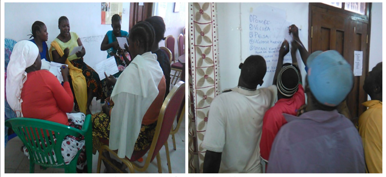
Fig. 2 A picture showing participants conducting member check for qualitative data validation

Table 3 presents the results of the multinomial logistic regression analysis. The majority of the independent predictors of the proxy lifetime extramarital affairs were consistent with those in recent (12 months prior to survey) extramarital affairs. The relative risk ratio (RRR) of having extramarital affairs versus non-extramarital affairs in the proxy-lifetime significantly decreased as age increased (RRR: 0.98 95% CI 0.98–0.99), was higher among men (RRR: 1.27; 95% CI 1.06–1.52), among members of a Village Community Bank (VICOBA) (RRR: 1.35; 95% CI 1.08–1.69), among consumers of alcohol (RRR: 1.54; 95% CI 1.29–1.82), among those who re-married (RRR: 2.50; 95% CI 2.07–3.02) and were lower among those of catholic religion (RRR: 0.82; 95% CI 0.71–0.95),