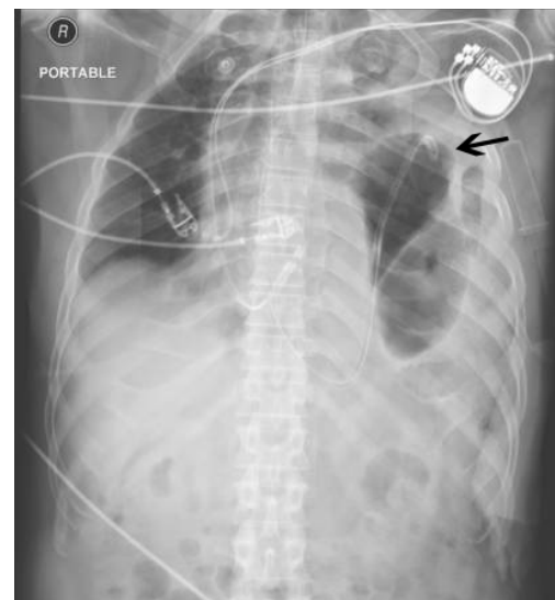
Figure 2. Portable anteroposterior chest x-ray demonstrating successful nasogastric tube insertion with tip extending above ruptured diaphragm into thorax (arrow).