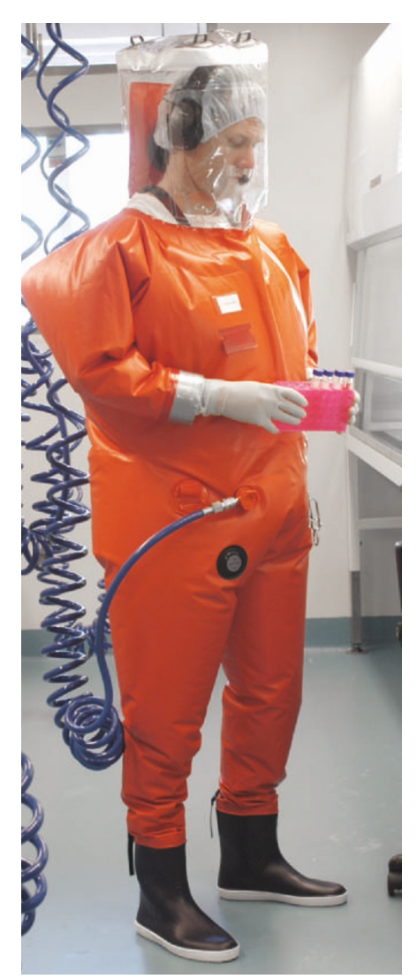
Staff trained in lab work are in short supply.

Against this background, it seems clear that Europe would benefit from a regional organization similar to the Atlanta CDC, which has large resources in terms of scientific expertise and laboratory capacity, and which can deploy field forces (epidemiologists and laboratory equipment) to the site of an outbreak at very short notice. The current difficulties of the European Union in collating and disseminating epidemiological information - as seen with SARS - will only get worse with the addition of ten new member states. Therefore the creation of an independent agency for surveillance and control of communicable diseases has been welcomed, and from 2005 the ECDC will operate from a base in Stockholm, Sweden.