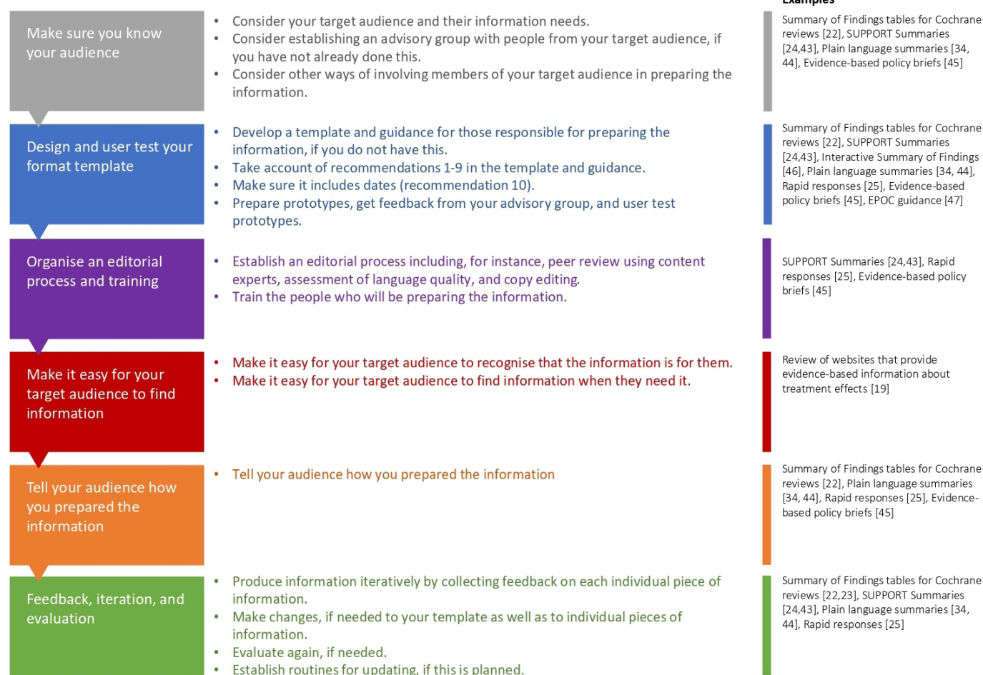
Figure 1 Flow chart outlining a process for producing evidence-based information about the effects of interventions

piece of information from people in your target audience; to make changes if needed (to your template as well as to individual pieces of information); and to evaluate again, if needed. It also includes establishing routines for updating the information that you prepare, if this is planned.