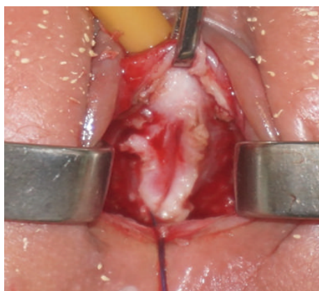
FIGURE 6: Dissection between urethra and vagina and beginning of urethral closure.

In our case the location was midurethral. We used a vaginal route with economic tissue resection. The fibrosis around the fistula was relatively easy to dissect. This allowed us to cure the fistula with a satisfactory postoperative result (no micturition disorder due to sphincter damage). In some cases, the surgical strategy is complex. In a case of fistula of the proximal urethra in a 6-year-old girl, the approach was abdominal [5]. This may be explained by fibrosis induced by previous interventions. In our case, the fistula was easily accessible by vaginal route and managed by a single suture without resecting much tissue. Tissue loss is a characteristic of urethrovaginal fistulas. Economic excision of a periurethral tissue is recommended because the narrowness of the operating field does not allow tissue interposition [3]. Our cure was relatively easy as it was the first attempt. The postoperative recovery was simple and immediate and long-term results were considered satisfactory. A cystography 14 days after the procedure is recommended before removing the tube [1]. We do not do cystography in practice. Complications are possible; it may be either urinary incontinence or a urethral stricture to the contrary [3]. These complications are feared and cannot be predicted. Ockrim et al. [2] have found no predictor of success for urethrovaginal fistula cure. In contrast, for a vesicovaginal fistula over 3 cm the absence