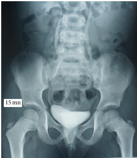
FIGURE 2: 15 min IVU radiography. Bladder filling and vagina opacification.