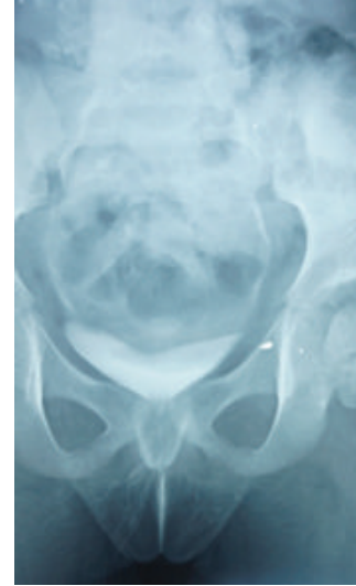
FIGURE 3: Urinary leakage.