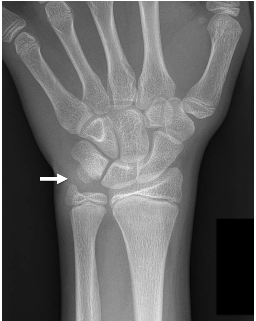
FIGURE 1: 13-year-old boy with chronic ulnar sided left wrist pain

This initial frontal radiograph of the left wrist was interpreted as normal. The arrow indicates the area of the patient's reported pain.