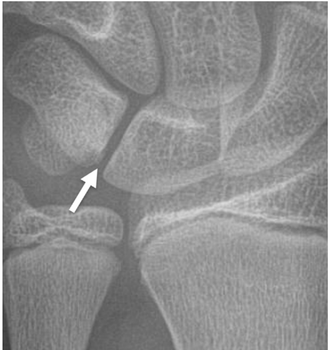
FIGURE 5: Magnified image of the same child's initial frontal wrist radiograph

There are very early radiographic findings of a lunotriquetral coalition with close apposition of the proximal aspects of the lunate and triquetrum with a 'parallel cortex' appearance (arrow).