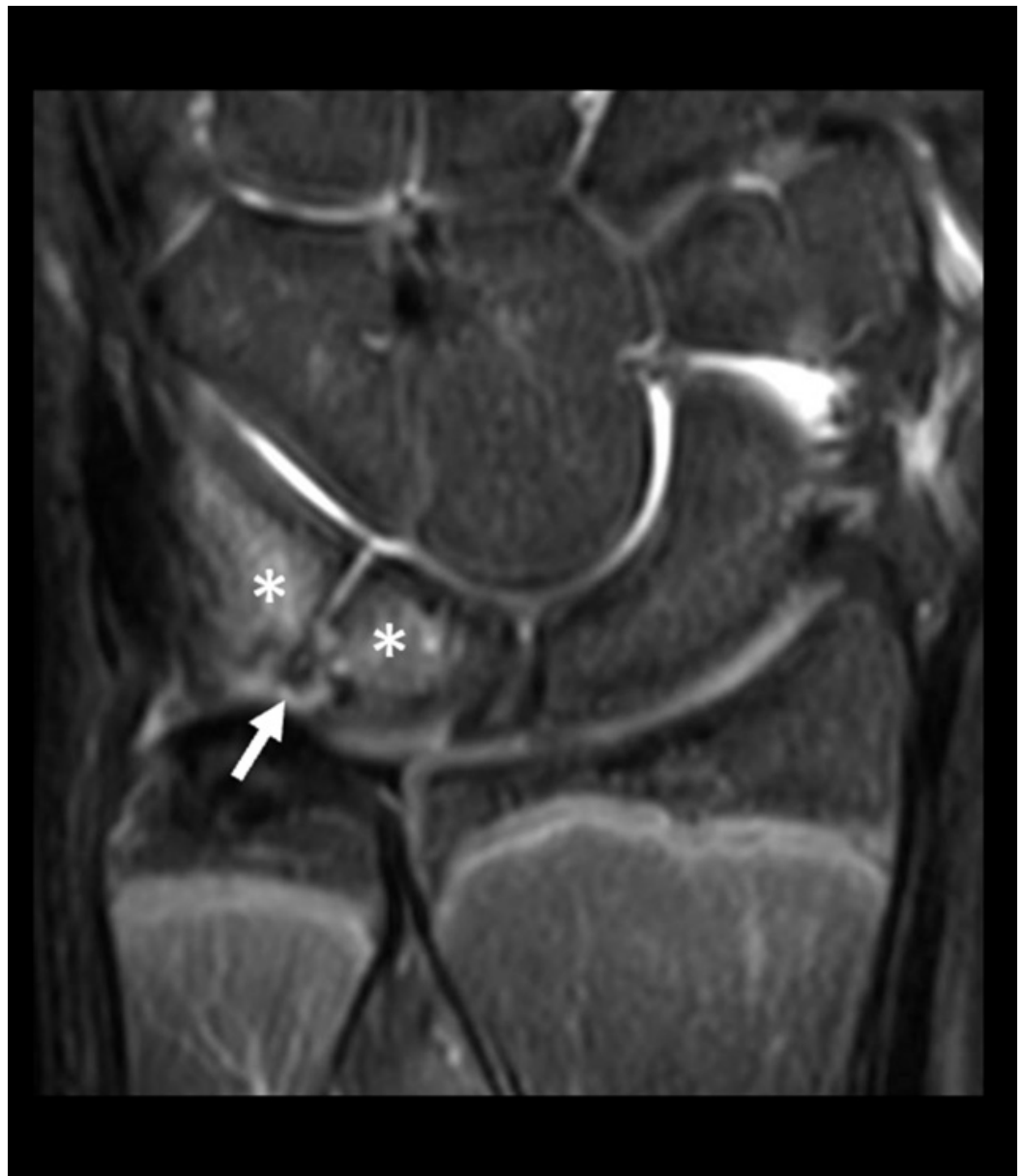
FIGURE 3: Coronal T2-weighted fat-suppressed magnetic resonance (MR) image from the same MR scan as the prior figure

There is edema-like signal (asterisks) within the lunate and triquetrum adjacent to the coalition (solid arrow), consistent with stress changes.