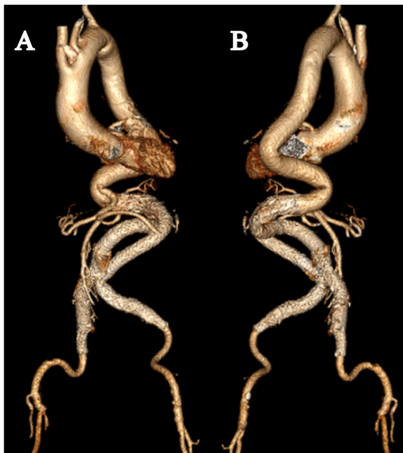
Figure 3 Anterior (A) and posterior (B) view of 3-dimensional reconstructions at 6 months follow-up showed favorable stent-grafts positions and continued perfusion of both femoral and renal arteries.

angulation > 60^\circ and neck calcification or thrombus covering > 50\% circumference of aortic diameter and a reverse taper morphology [11]. Interestingly, growing recent studies showed feasibility and safety of EVAR in patients with hostile neck, but the anatomical indications of outside EVAR instruction for use (“off-label use”) reach no common consent [4,12,13]. Given the need of intervention and patient’s refusal to open surgery, an endovascular approach was performed despite severely angulated neck and hostile artery access in our case.