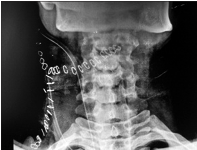
Figure 5: Postoperative radiograph after screw removal and wound closure