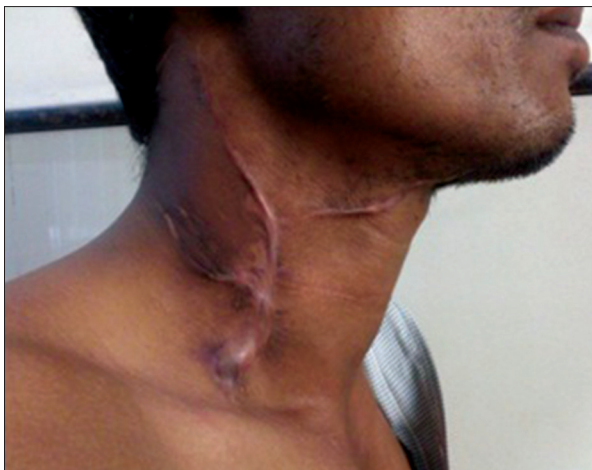
Figure 6: Healed wound and sinus