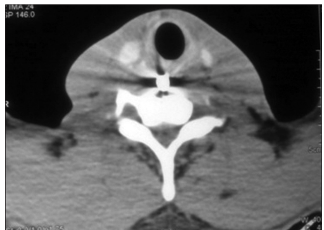
Figure 3: Computerized tomography scan showing the prominent screw head of the implant

5 days) was given. The culture report showed beta-hemolytic streptococci sensitive to linezolid, rest all reports were negative. These were given intravenous for 2 weeks and then