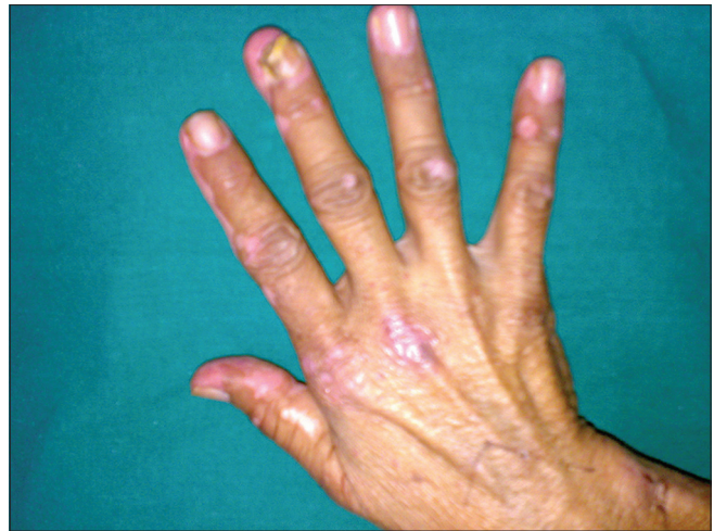
Figure 1: Hyperkeratotic, erythematous, flat papules with central atrophy

The diagnosis of DM is considered definitive in case of presence of 5 th plus any three of first four criteria and probable in case of presence of 5 th plus any two of first four criteria. The pathognomonic cutaneous lesions of DM are Gottron's papules and Gottron's sign. Gottron's papules consists of violaceous flat top papules over dorsal aspect of inter-phalangeal joints of hands. Gottron's sign consists of macular violaceous erythema with or without edema over