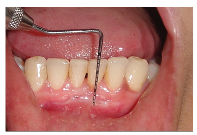
Figure 7: 3 months post-operative