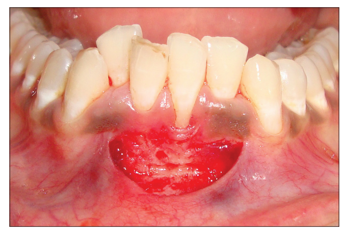
Figure 3: Fenestration given at the base of the defect