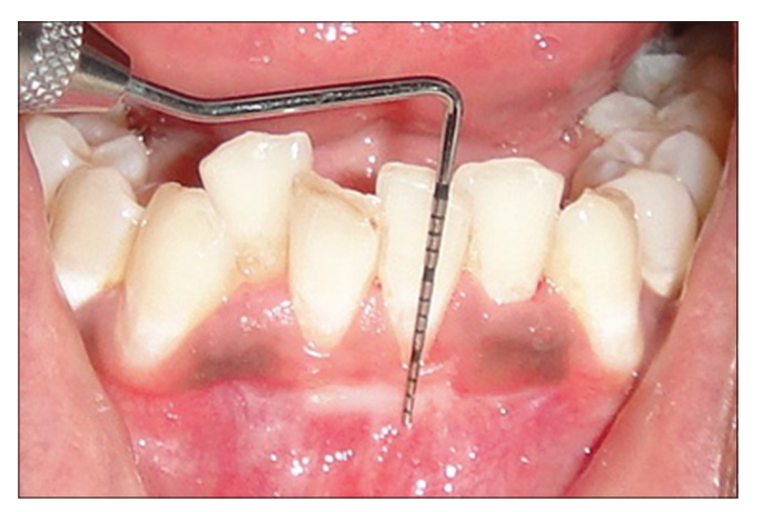
Figure 6: 3 months post-operative

14 days. All the patients were placed on 0.2% chlorhexidine gluconate rinse, twice daily for 3 weeks and recalled at regular intervals.