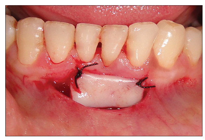
Figure 5: Graft placed at recipient site

During the course of the study, wound healing was uneventful in both the groups. Table 1 shows mean and