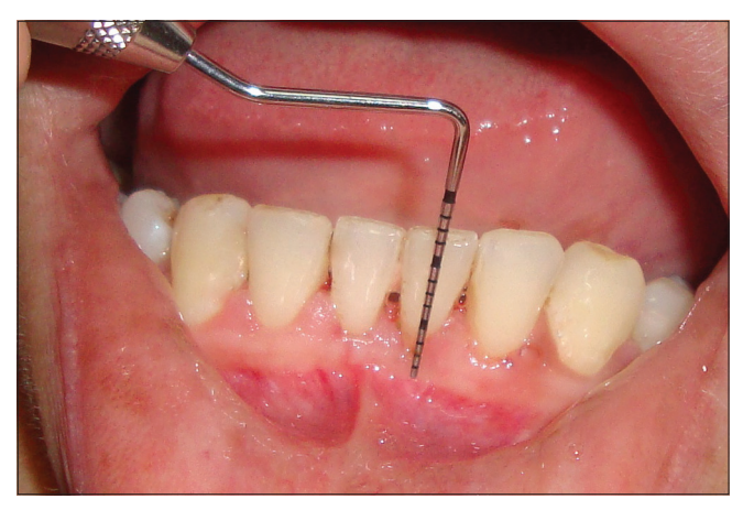
Figure 2: Pre-operative vestibular depth