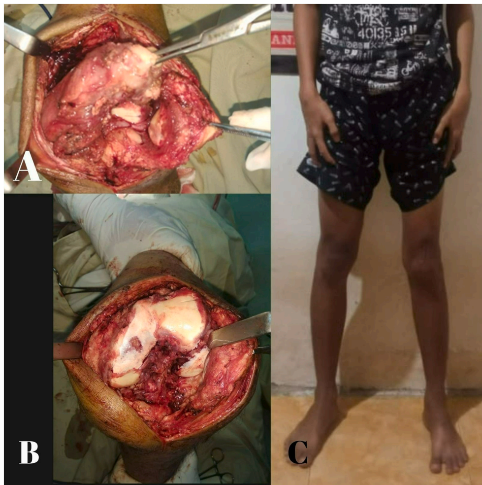
Fig. 3. Intraoperative gross appearance of the lesion in the knee joint (A); femoral cartilage appearance intraoperatively after synovectomy (B); clinical follow-up at 24 months after surgery (C).

complications of the disease process. The main indications for surgery are unresponsiveness after 4 to 5 months of the anti-tuberculous drug, severe joint destruction, joint deformity, large abscesses, neurological compromise, and painful joint ankylosis. The range of surgical procedures that could be carried out includes drainage of abscesses, synovectomy, excisional arthroplasty, arthrodesis for the joint, and joint replacement if the TB has remained inactive for at least ten years [6]. The second patient underwent surgery because the pathology report showed a tuberculous infection with clinical manifestation of the late stage of TB arthritis characterized by large painful mass, swelling, and stiffness in his left knee. Intraoperatively we found fibrosis of the knee joint capsule and destruction of the femoral cartilage. Surgical intervention was preferred to detect related pathology and achieve better functional outcomes, resulting in less pain and increasing range of motion of the knee joint.