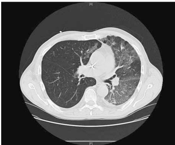
Figure 1 Computed tomography (CT) scans of the two patients at the time of pulmonary deterioration, each revealing diffuse ground-glass opacities consistent with viral infection.

extensive ground glass opacities in the left lung and small areas of ground glass opacity in the right middle and lower lobes (Figure 1). BAL was positive for rhinovirus by PCR and bacterial cultures grew mixed oral flora. All additional bronchoscopic studies were negative (Table 1).